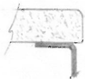
Negative Reveal (our Standard)